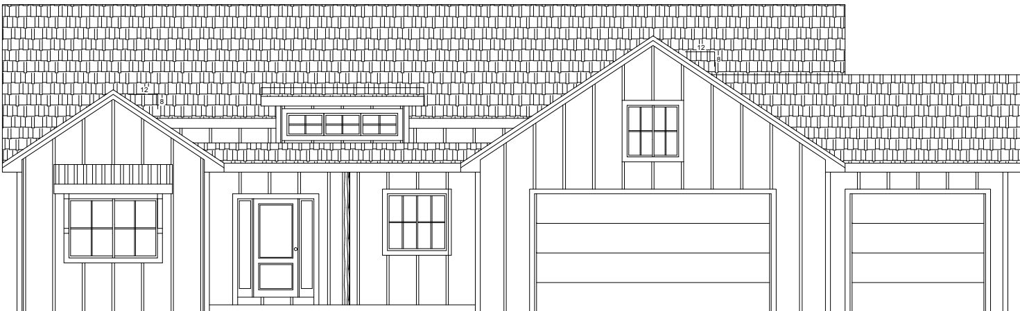
FRONT ELEVATION W/ 3RD CAR OPTION

Square Footage: First Floor 2042sf Basement Floor 2037sf Total Living Area: 4079sf