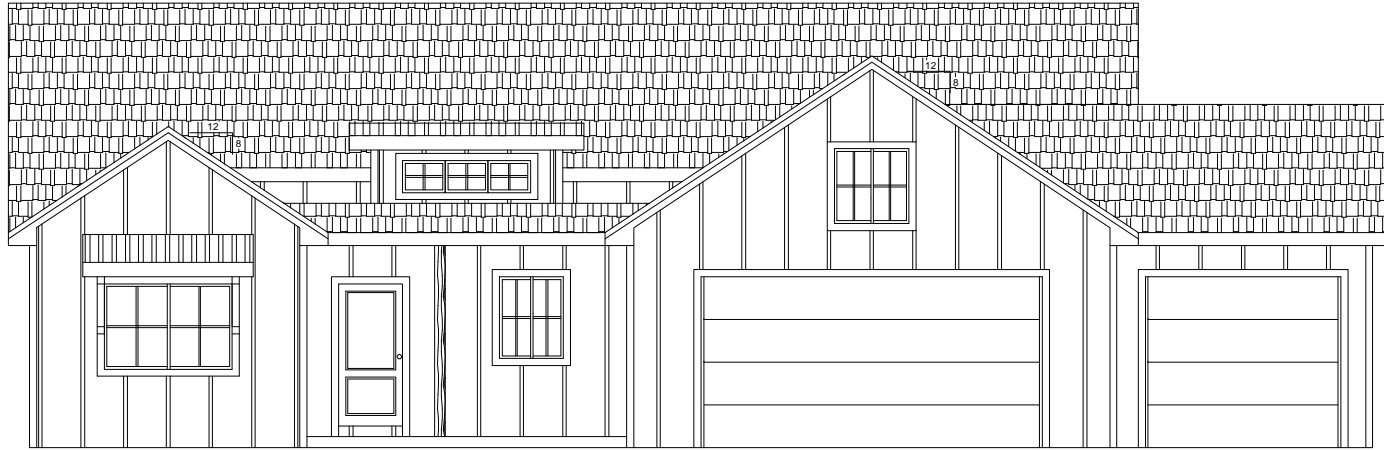
FRONT ELEVATION W/ 3RD CAR OPTION

Square Footage: First Floor 1904sf Basement Floor 1899sf Total Living Area: 3803sf